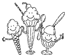
Ice Cream Tour

Sunday, April 24 th is the registration deadline for the Youth Ice Cream Tour. As the Youth Choir is away on tour in Richmond, VA, we'll remember them as we indulge in some delicious frozen treats and sooth our throats!