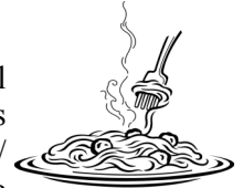
Pasta & Sauce

The next "Food on the First" items will be spaghetti sauce and pasta. Sauces should be in smaller, about 15 oz. jars/cans so that patrons can consume the quantity and carry it home. The Allentown Ecumenical Food Bank is the recipient of your generous donations and is very grateful for this continued support